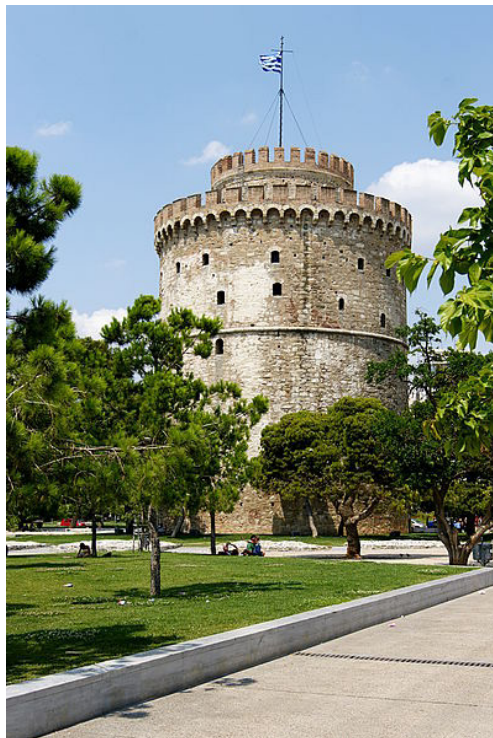
The White Tower, Thessaloniki